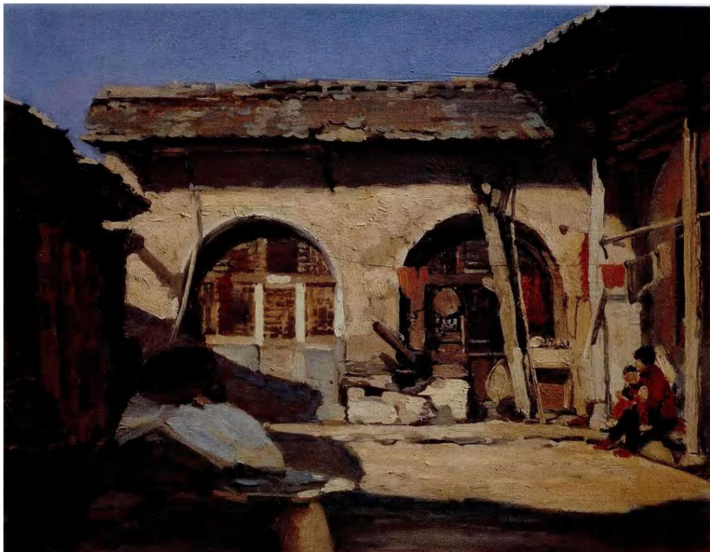
Figure 4: Yaodong (Cave Dwellings) in Babao, 50cm x 60cm, Sun Lixin, 2004