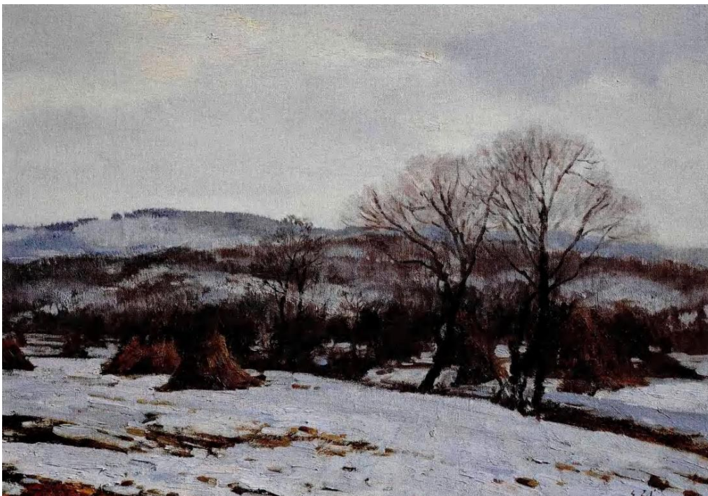
Figure 2: Morning Frost, 50cm x 60cm, Sun Lixin, 2011