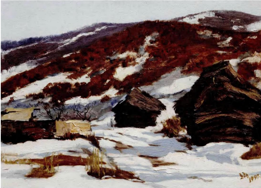
Figure 1: Winter Sunshine, 50cm x 60cm, Sun Lixin, 1997

refinement and tempering of his personal will but also a profound retrospective and dedicated inheritance of the local spirit of Chinese oil painting. May Lixin continue to uphold this spirit, without distraction, and amidst the interweaving of military journeys and travels, paint even more refined and advanced chapters of his art.